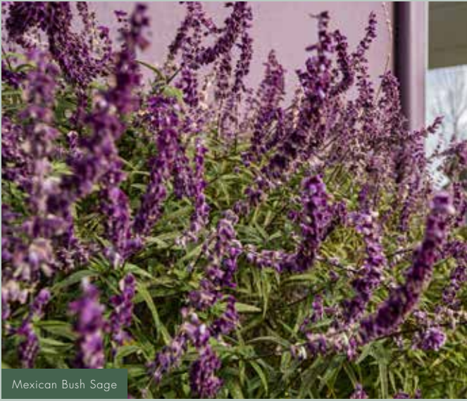
Mexican Bush Sage