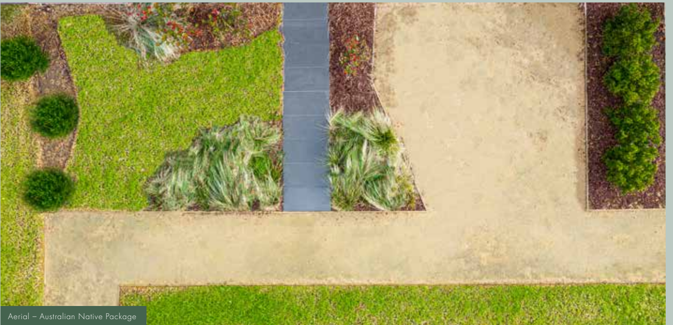
Aerial - Australian Native Package