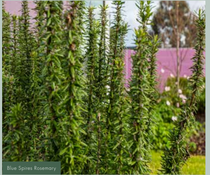
Blue Spires Rosemary