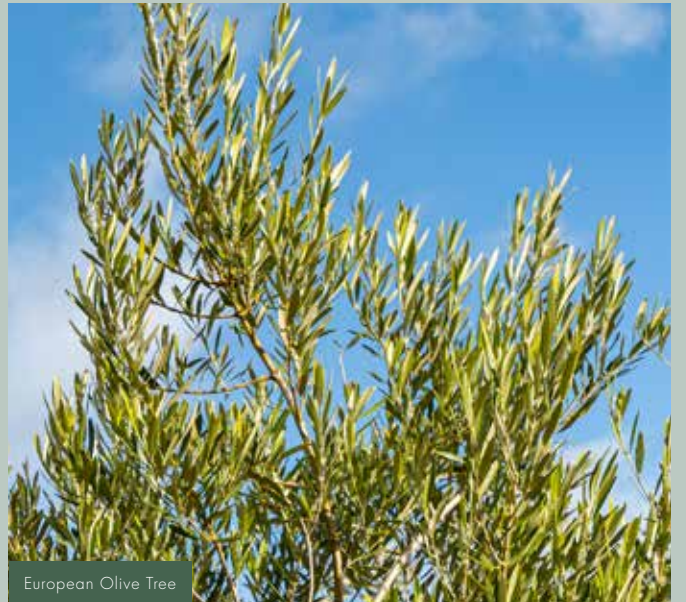
European Olive Tree