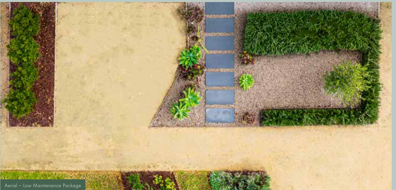
Aerial - Low Maintenance Package